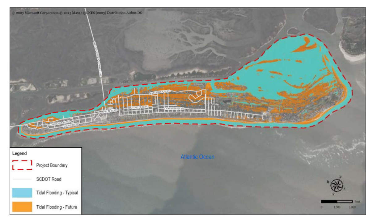
Preliminary flood vulnerability due to intermediate sea level rise projections (3.89 feet) for year 2100.

Resilience and adaptation planning iterative process as outlined by NOAA