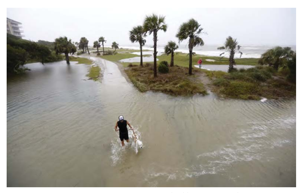
Storm surge flooding during Hurricane Joaquin (2015) (source: Mic Smith, AP).