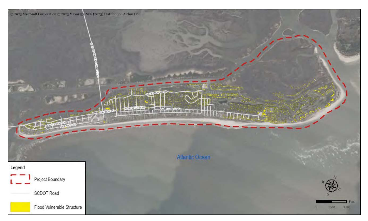
Preliminary structure vulnerability due to intermediate sea level rise projections (3.89 feet) for year 2100.