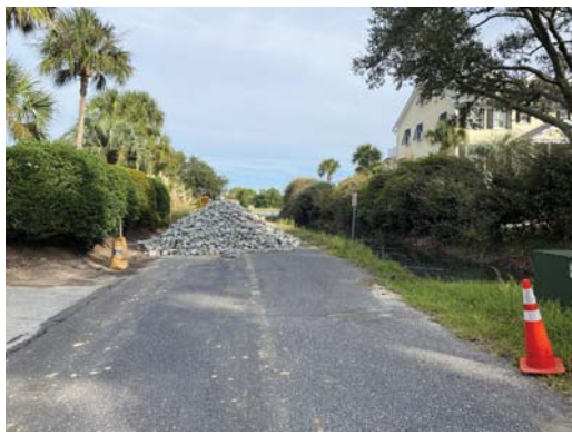
Check valve and earthen berm installation at 25th Avenue by SCDOT in October 2022.